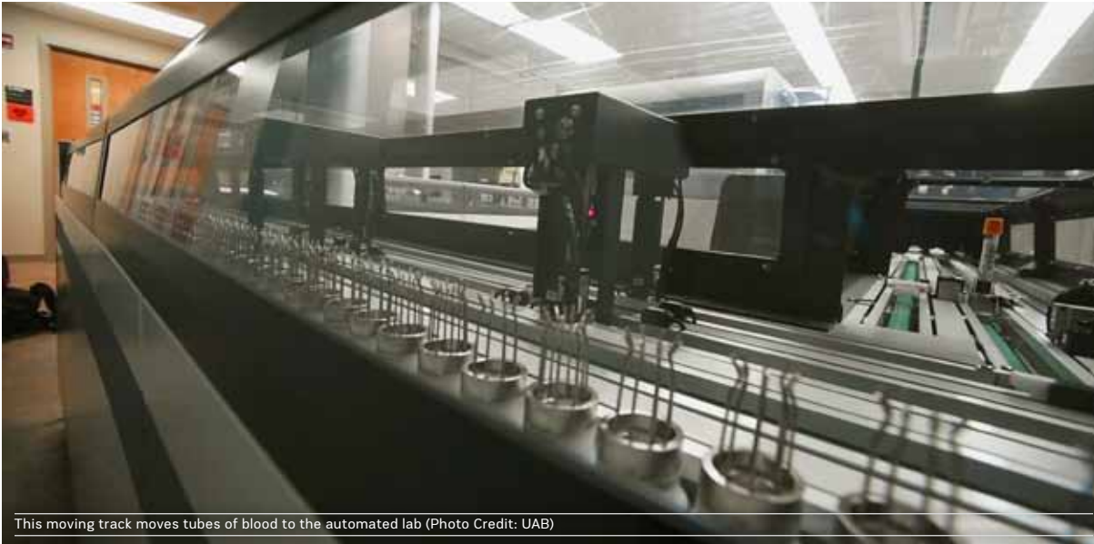
This moving track moves tubes of blood to the automated lab