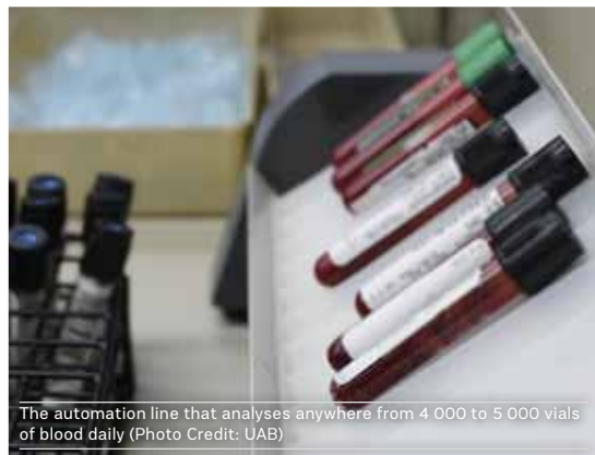
The automation line that analyses anywhere from 4 000 to 5 000 vials of blood daily

order additional test(s), instead of collecting another tube of blood, automation mechanisms sequester the original tube from the storage area and rerun the specimen through the designated analyser. Automation programming manages the needs of the specimens. The specimens are de-capped, centrifuged, re-aliquoted, analysed, and then re-capped through automation methods. All procedural steps function through the means of robotic programming.