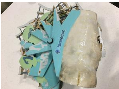
3D Print Created by TeraRecon and WhiteClouds - Layla the Rhinoceros | Brookfield Zoo

Advanced Visualization provider, TeraRecon, creates a 3D reconstruction of Eastern Black Rhinoceros' CT images from Brookfield Zoo, Brookfield, IL (USA) for a pre-surgical 3D print.