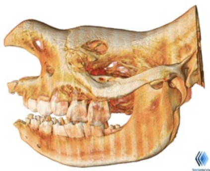
TeraRecon 3D Reconstruction of Rhinoceros CT Images

In preparation for a recent surgery on rhinoceros, Layla, at Brookfield Zoo in Chicago, Illinois, medical imaging software provider, TeraRecon, and 3D Printing manufacturer, WhiteClouds utilized their technologies to help veterinary surgeons prepare. Layla is a 2,300lb., 7-year-old Eastern Black Rhinoceros with an impacted molar tooth and associated sinus infection that were causing life-threatening complications in her ability to breathe. A recent CT scan at the zoo was the first of its kind and revealed the need for surgical intervention. Using the imaging data from the CT Scan, a 3D computer reconstruction was made and a printed model of Layla's anatomy was produced for surgical planning.