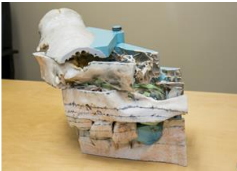
3D Print Created by TeraRecon and Whiteclouds - Layla the Rhinoceros | Brookfield Zoo

A hinge-and-slice 3D print of rhinoceros anatomy used for pre-surgical planning at Brookfield Zoo.