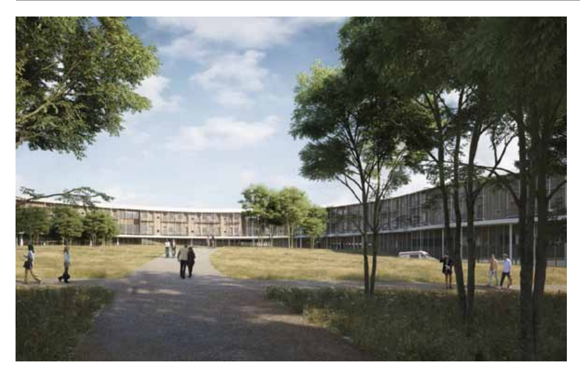
Figure 4. Nyt Hospital Nordsjælland by VLA with Herzog & De Meuron Architects – Internal.