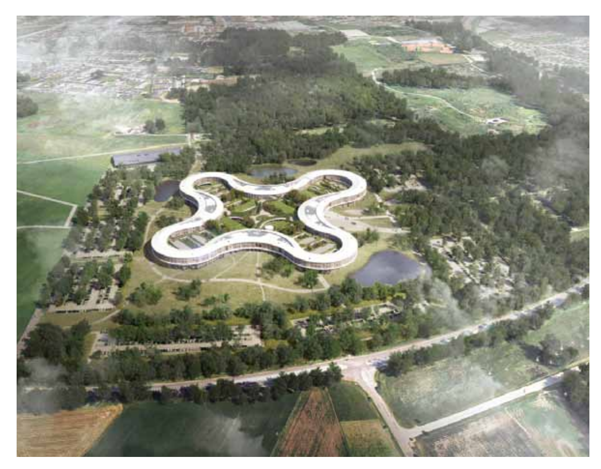
Figure 3. Nyt Hospital Nordsjælland by VLA with Herzog & De Meuron Architects – Aerial.