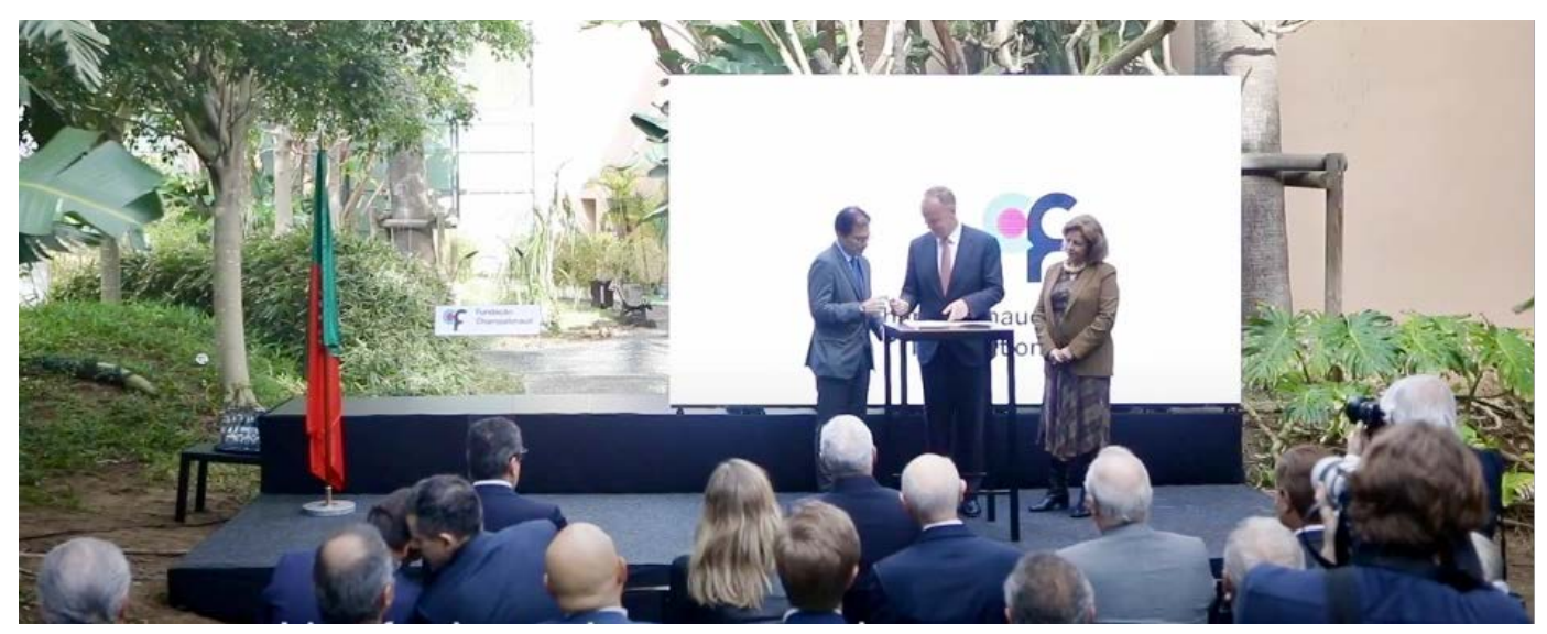
Image 1: Champalimaud Foundation and Philips Partnership ceremony, 09 March 2023